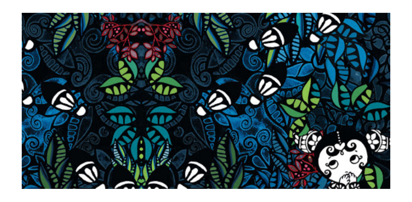
I hear some steps! Who is that? Who is that?