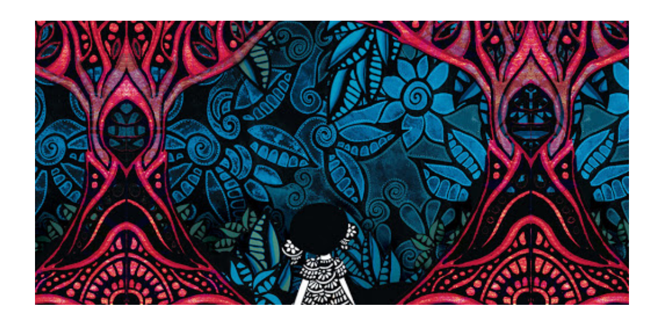
And this noise? Crack, crack, crack! What is that?