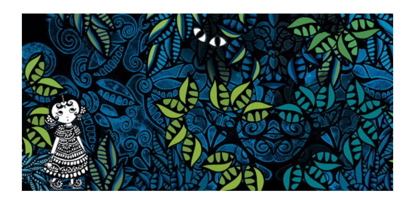
It's so dark! Is there anyone? Who is it?