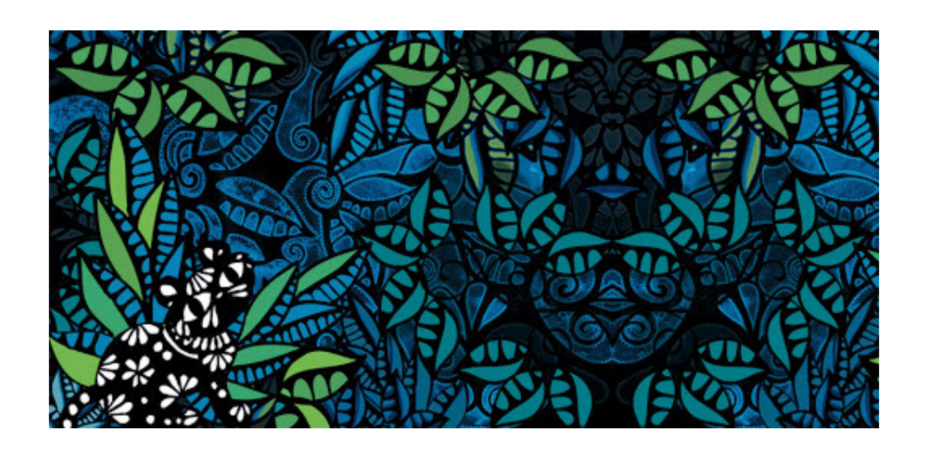
Oh, it's only a cat. I'm not scared.