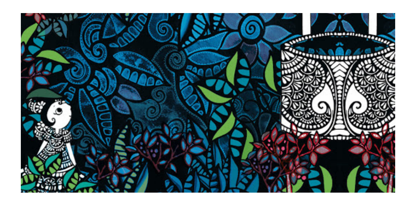
Oh, it's only a well. I'm not scared.