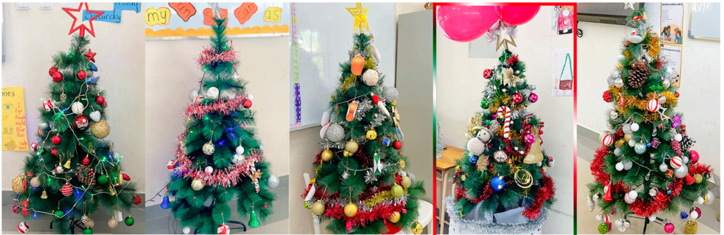
Grade 1 A

After meticulous judging, it was Grade 2B that emerged victorious, capturing the hearts of both students and faculty with their stunningly decorated Christmas tree. To reward the students of Grade 2B for their exceptional effort and festive flair, each young participant was presented with a delightful surprise—a 3D wooden model puzzle.